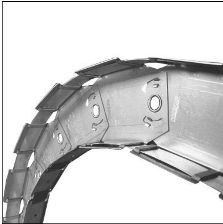
Figure 4: Flex-C Trac. ( http://www.proplaster.com.au/products/flex-c-trac-system-with-hammer-lock-feature )

Flex-C Trac (see Figure 4) with Hammer-Lock feature is offered by Flex-Ability Concepts. The company produces track for light gauge steel framing that curves, allowing the builder to quickly erect curved walls and arched doorways. The Flex-C Trac with hammer lock offers a feature where “once the track is formed simply hammer down the tabs to secure the shape. It’s fast and strong (Flex-Ability Concepts, 2007).”