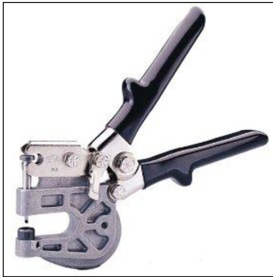
Figure 2: Picture of a clinching tool.

Clinching - a mechanical fastening method to join sheet metal without additional components using special tools to form a mechanical interlock between the sheet metals. The tools consist typically of a punch and a die. There are two primary types of dies: solid "fixed cavity" dies, and dies with moving components. The punch forces the two layers of sheet metal into the die cavity forming a permanent connection. The pressure exerted by the punch forces the metal to flow laterally. Clinching is used primarily in the automotive, appliance and electronic industries, where it replaces spot welding very often. See Figure 2.