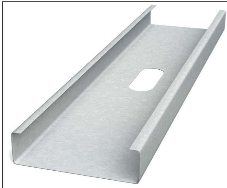
Figure 1: Picture of a C-Stud.