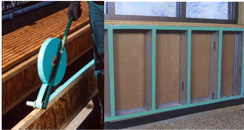
Figure 6: Integrity™ Gasket forms a thermal break at external wall framed with metal studs to prevent "shadowing" on gypsum board and reduce sound transmission. ( http://www.integritygasket.com/oldgallery1.asp )

A light gauge steel framer, Erik Elwell has framing with light gauge steel down to a science. One of the things he incorporates in his work is foam strips called Shadwell 143 Integrity Gasket shown in Figure 6 that attach directly to the studs and tracks – between the screws. This enhances the sound attenuation of the walls and creates a flat surface for hanging drywall (Elwell, 2005).